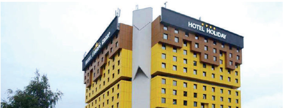
Hotel Holiday, Congress Center, st. Zmaja od Bosne 4, Sarajevo

The First Congress of Endoscopic Surgeons of Bosnia and Herzegovina (AESBH) will be held in Sarajevo, Bosnia and Herzegovina, from Friday 9th to Sunday 11th September 2022. All scientific sessions and the commercial exhibition will be held at the Congress Center of the Holiday Hotel.