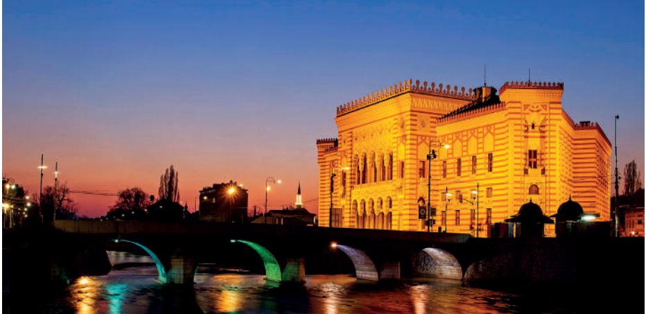
Vijećnica (st. Obala Kulina Bana)

After the opening ceremony, you are invited to the dinner at the Vijećnica (City Hall).